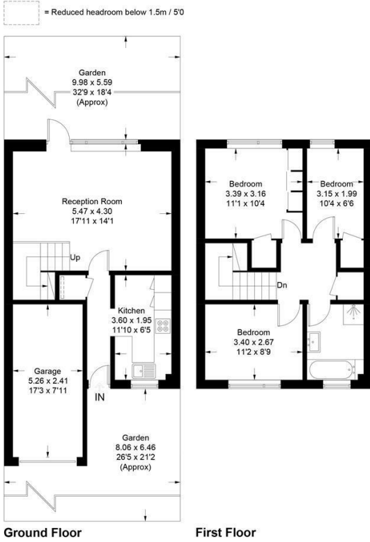
Illustration for identification purposes only, measurements are approximate, not to scale. Fourfabs.co © (ID1237550)